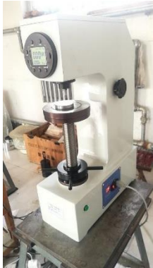
Metal Harness Digital Meter