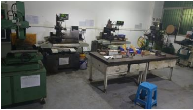
Molds Assembly Platform Corner