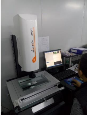
2.5 Dimension Projector tester

All products will be 100% tested before shipment; And our factory is equipped complete testing devices for our production inspection!