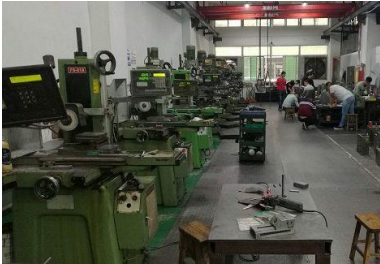
Grinding, Milling, Drilling